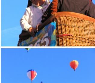
You can imagine my surprise when I turned around to find him in the basket going UP...UP...AND...AWAY!!